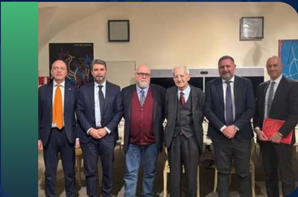
Harborsafe Investment Team Members